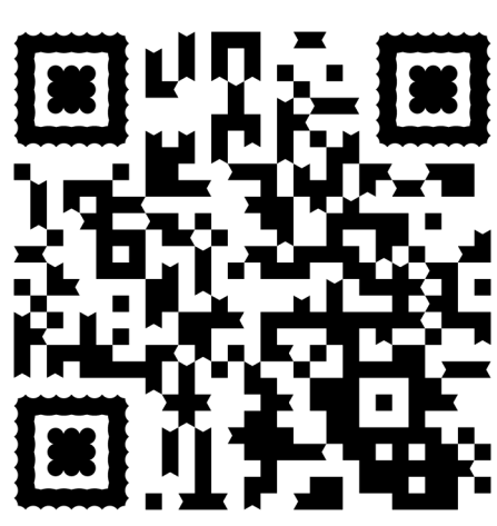
Dates may vary, please scan QR code for upcoming dates.

Scan the QR code or visit watertownregional.com and click on 'classes and events' for more information and to view upcoming dates.